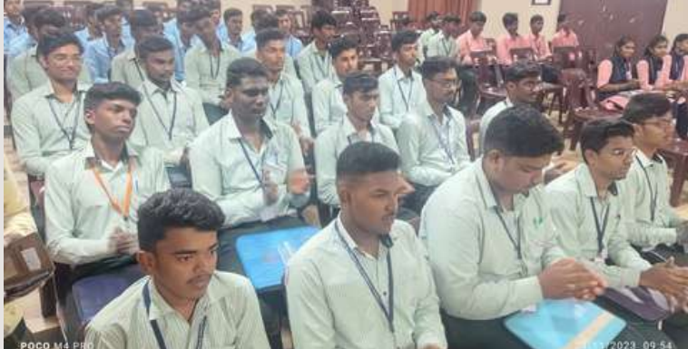
Campus Interview from HTL, Hosur