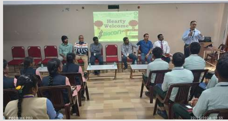
Campus Interview from Biocon Limited, Bangaluru