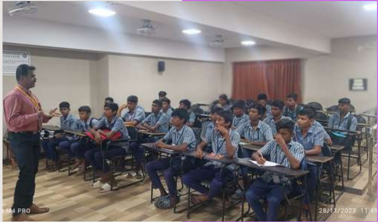
Practical session to GHSS, Shoolagiri