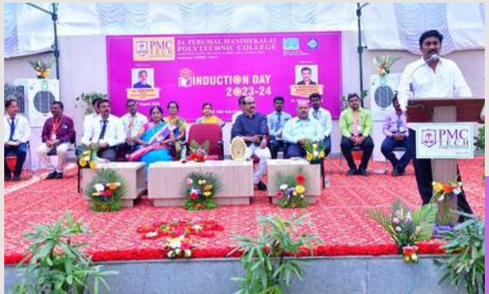
First year Induction Program - 2023-24