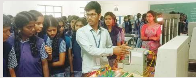
School Students Exposure visit to our department