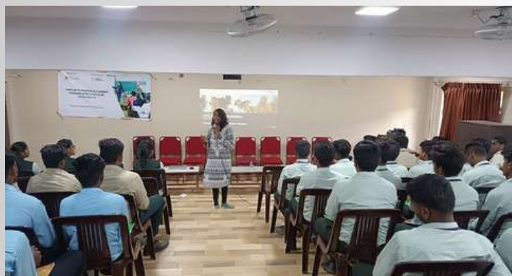
Greenskills Training by Microsoft and TNS Foundation