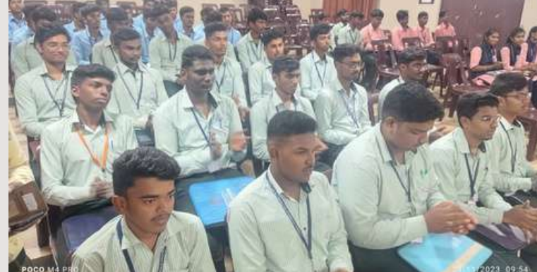
Campus Interview from HTL, Hosur