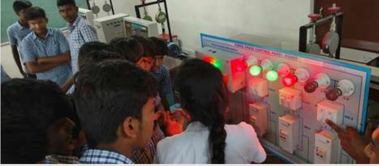
School Students Exposure visit to our department