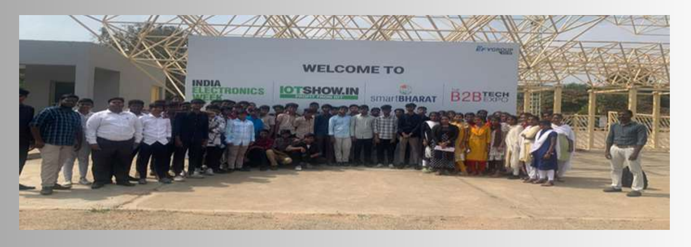
Industrial visit to IOT Show, Bangaluru