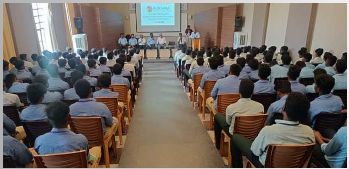
Guest Lecture on-Metal Injection Molding