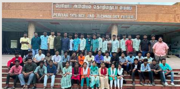
3 Days Educational Tour to Chennai