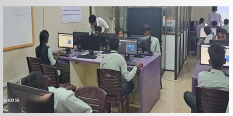
5 Days workshop on 'IOT and Its Applications under Nan Mudhalvan Scheme, Govt. of Tamilnadu