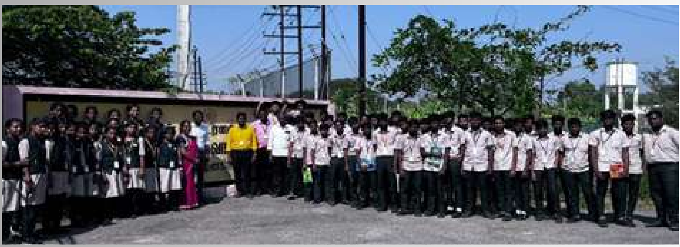
Industrial visit to Gurubarapally 230KV SS