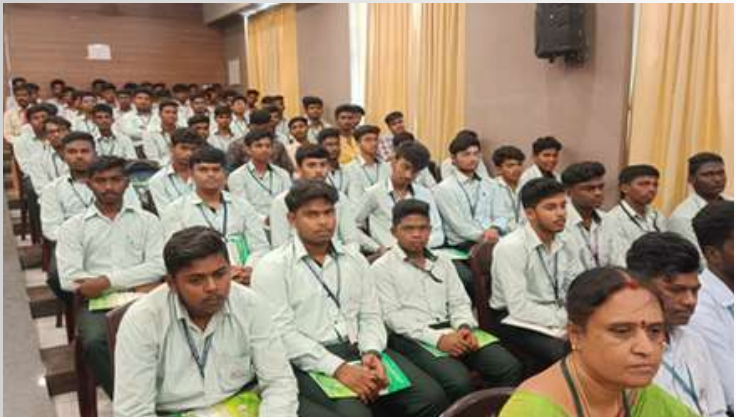
Two Days 2 days workshop on 'Technological advancement and challenges in power switching converters for renewable energy sources and fuel cell technology for E vehicles