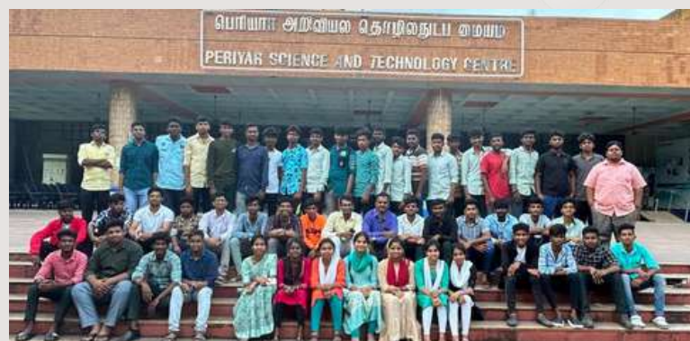
3 Days Educational Tour to Chennai