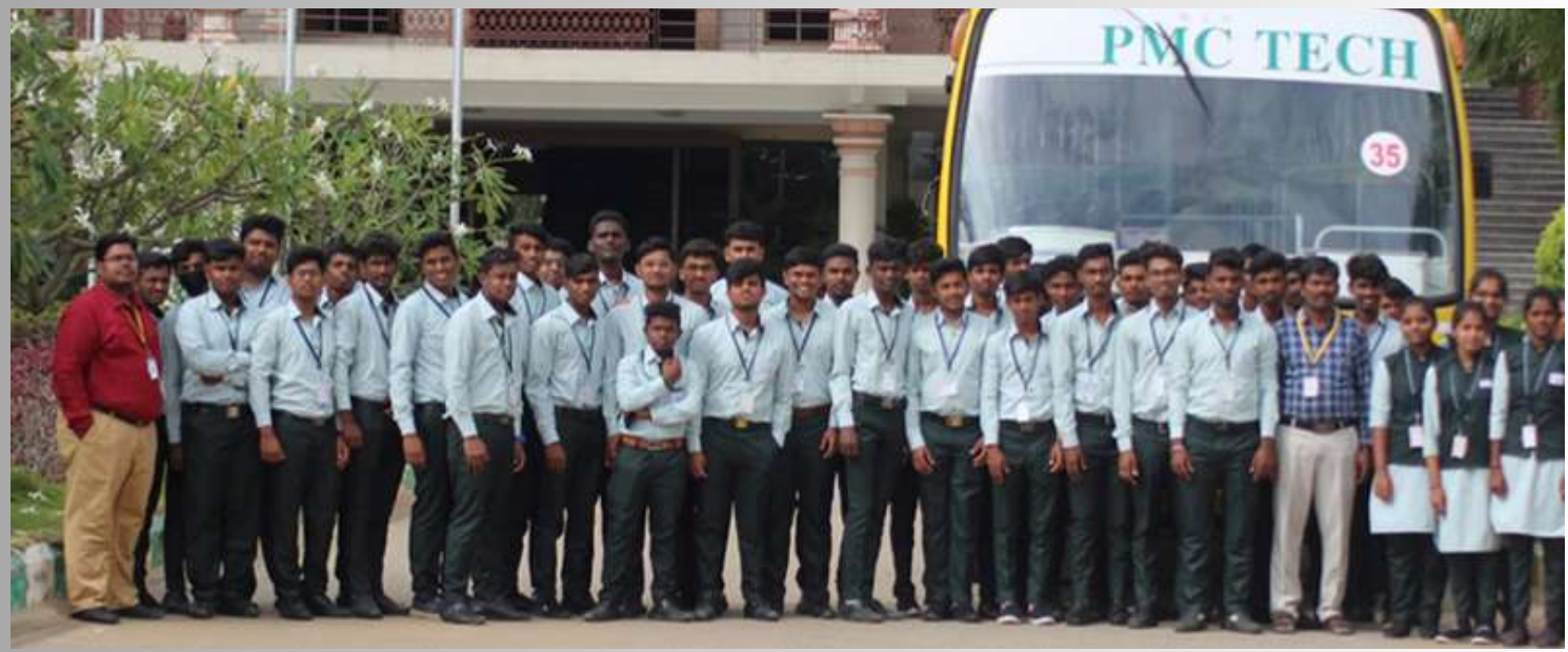
Industrial Visit to U R Rao Satellite Centre (URSC), Bangaluru