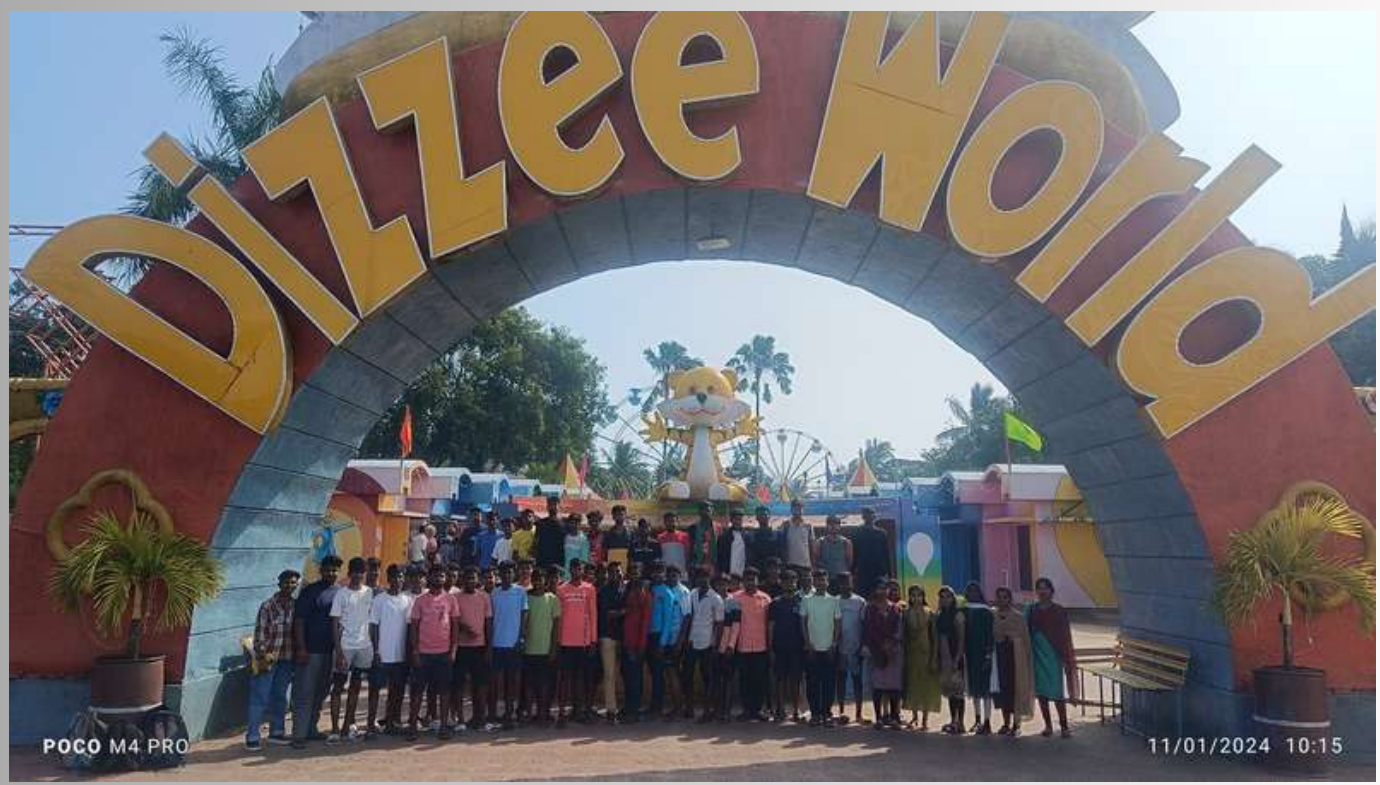
Industrial Tour to Chennai's BM Birla Planetarium, Nithyakalyana Perumal temple, Vandaloor Zoo & MGM Dizzee World