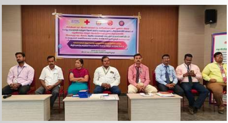
Anti Drugs Awareness Program