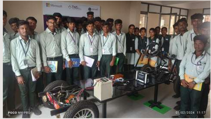
our 3 Year EEE Students visited Mircosoft GreenLab