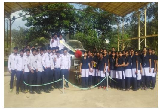
Third Yr CE Visited Doordharsan, Yercaud on 07/01/2020