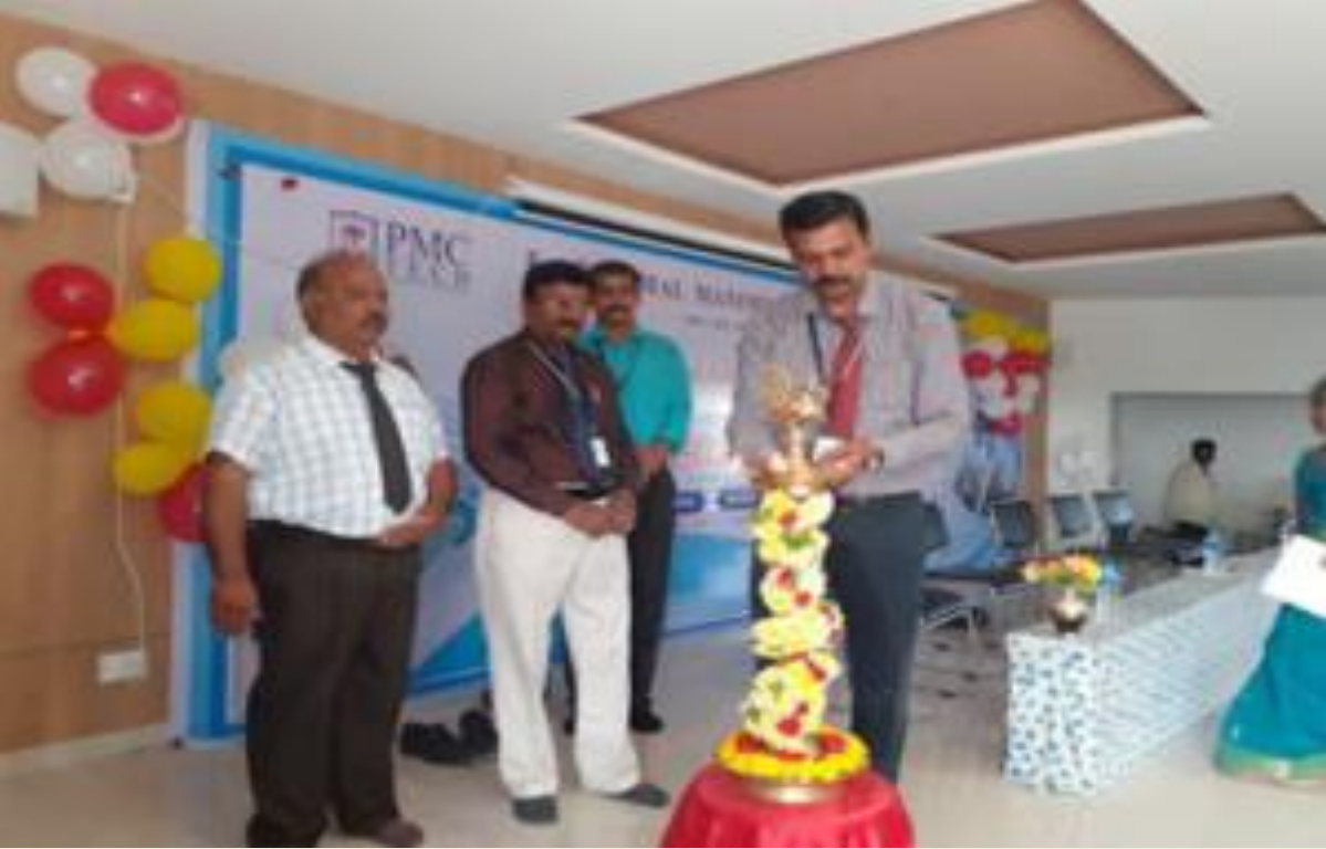
State level technical symposium CHROMEFEST on 06/02/2020