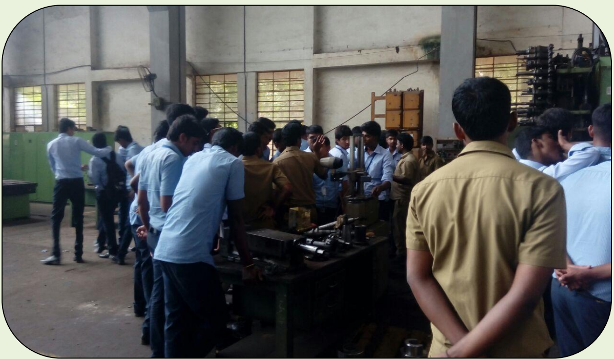
Industrial visit to AMSTEEL INDIA PVT LTD on JAN 2020