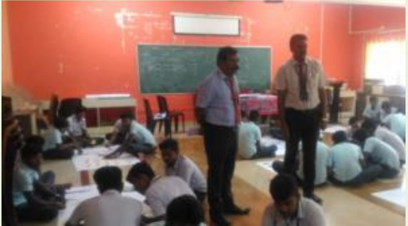
VLCI Training program

Our PMC Tech conducts VLCI program to enhance the confident level and team work to the students.