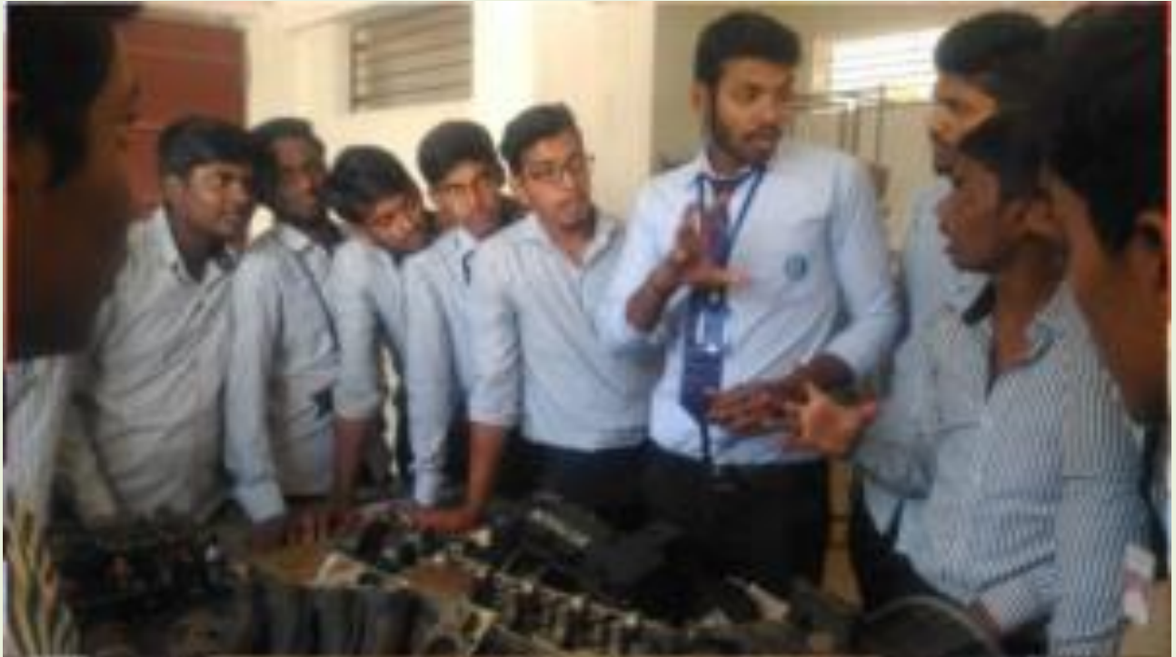
Goodwin Motors workshop on 02/01/2019