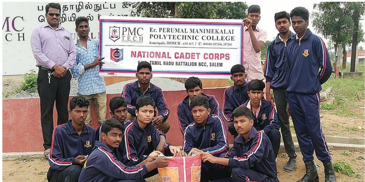
National Cadet Corps (NCC) - Swachh Bharath by our NCC cadets on 9 th Dec 2018