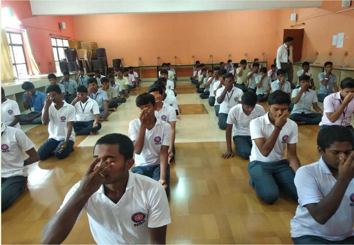
International Yoga Day 2019