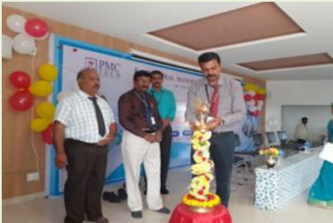
State level technical symposium on 06/02/2019