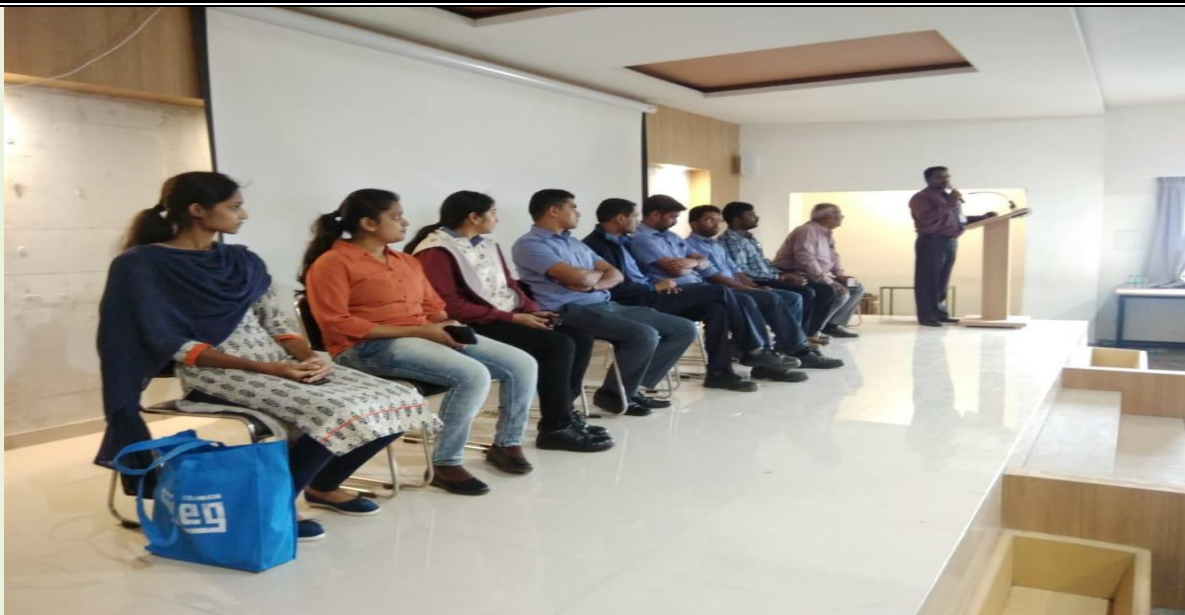
Campus Drive from HR Team of TVS, Hosur