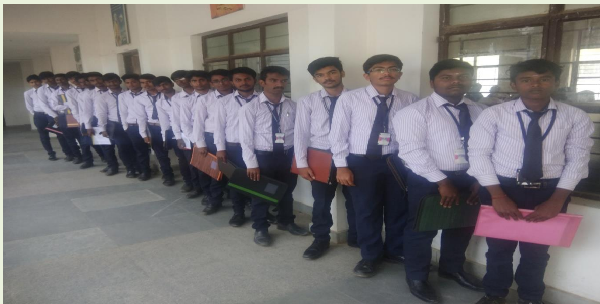
Students were going to attend interview