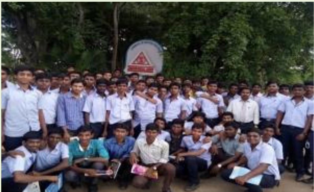
Industrial visit to Shardlow india Ltd on 04/01/2019