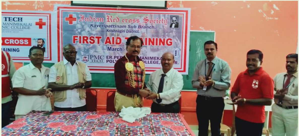
First aid Training Program to our All Final Year YRC Students on 03/04/2019

Humanity Impartiality Neutrality Independence Voluntary Service Unity & Universality