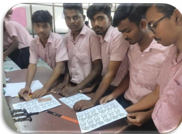
Value Added Course on Fabrication of Printed Circuit Board Design