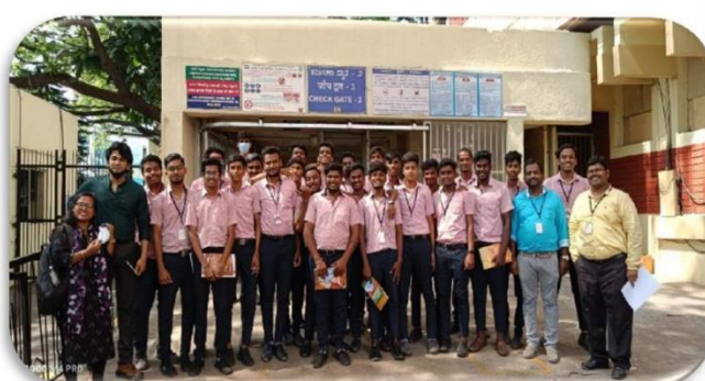
BHEL, Electronics Division, Bangalore