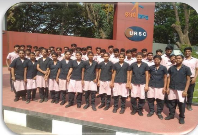
U R Rao Satellite Centre, Bangalore